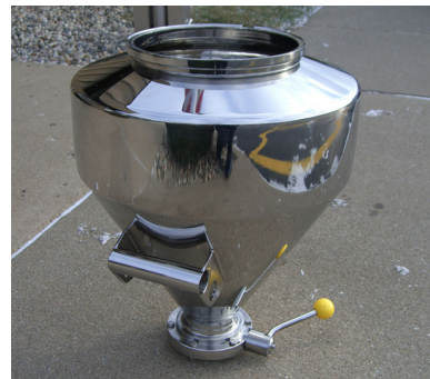
Hoppers & cyclones

Contact us today to see your work done W. Soule-style. info@wsoule.com www.wsoule.com 877.976.8531