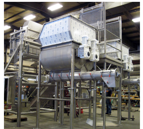
Processing line set-up